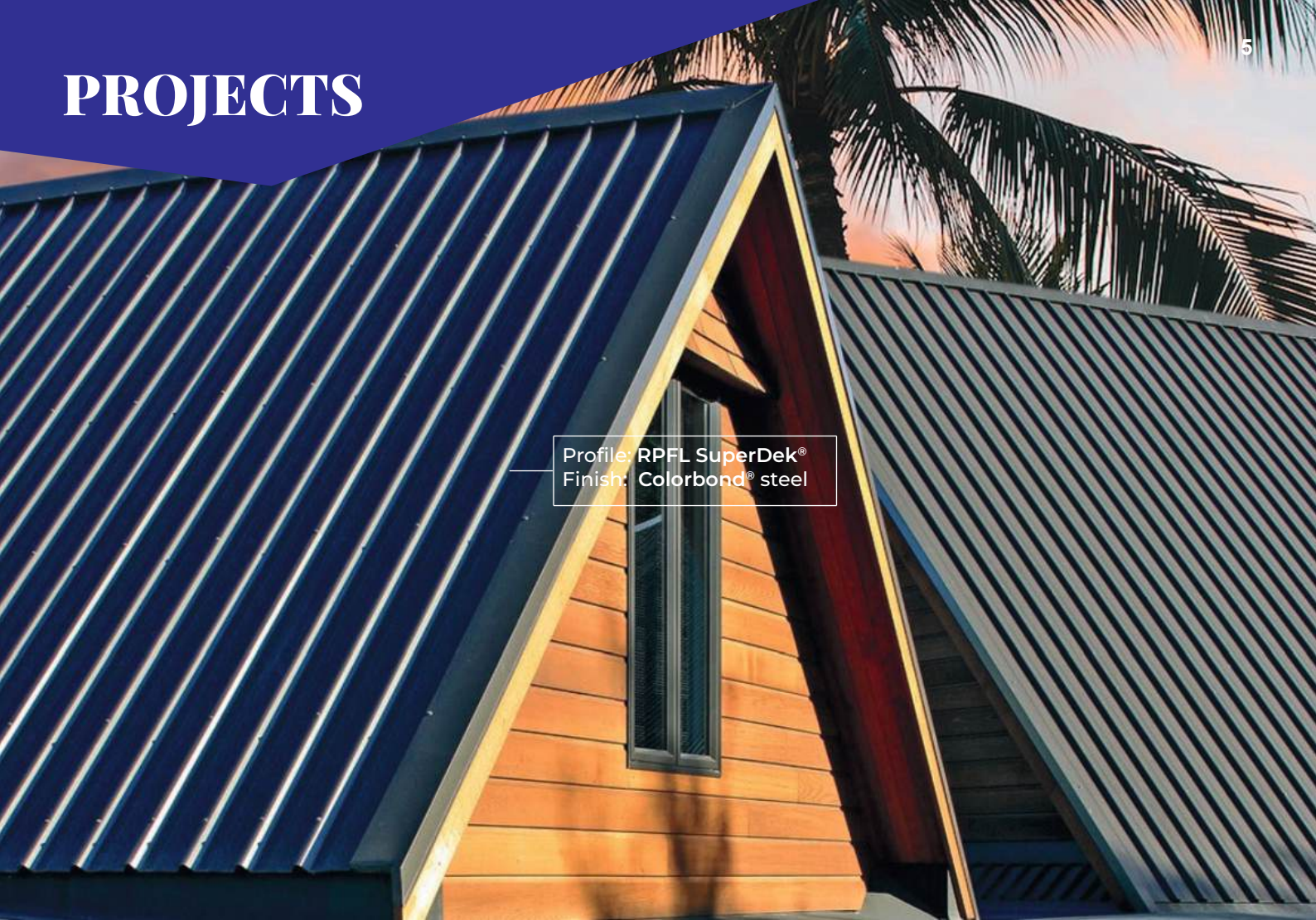
Profile: RPFL SuperDek® Finish: Colorbond® steel