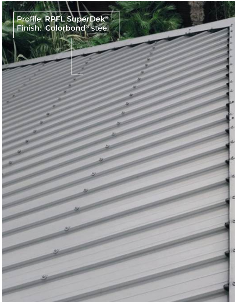
Profile: RPFL SuperDek® Finish: Colorbond® steel