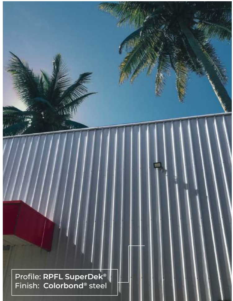
Profile: RPFL SuperDek® Finish: Colorbond® steel