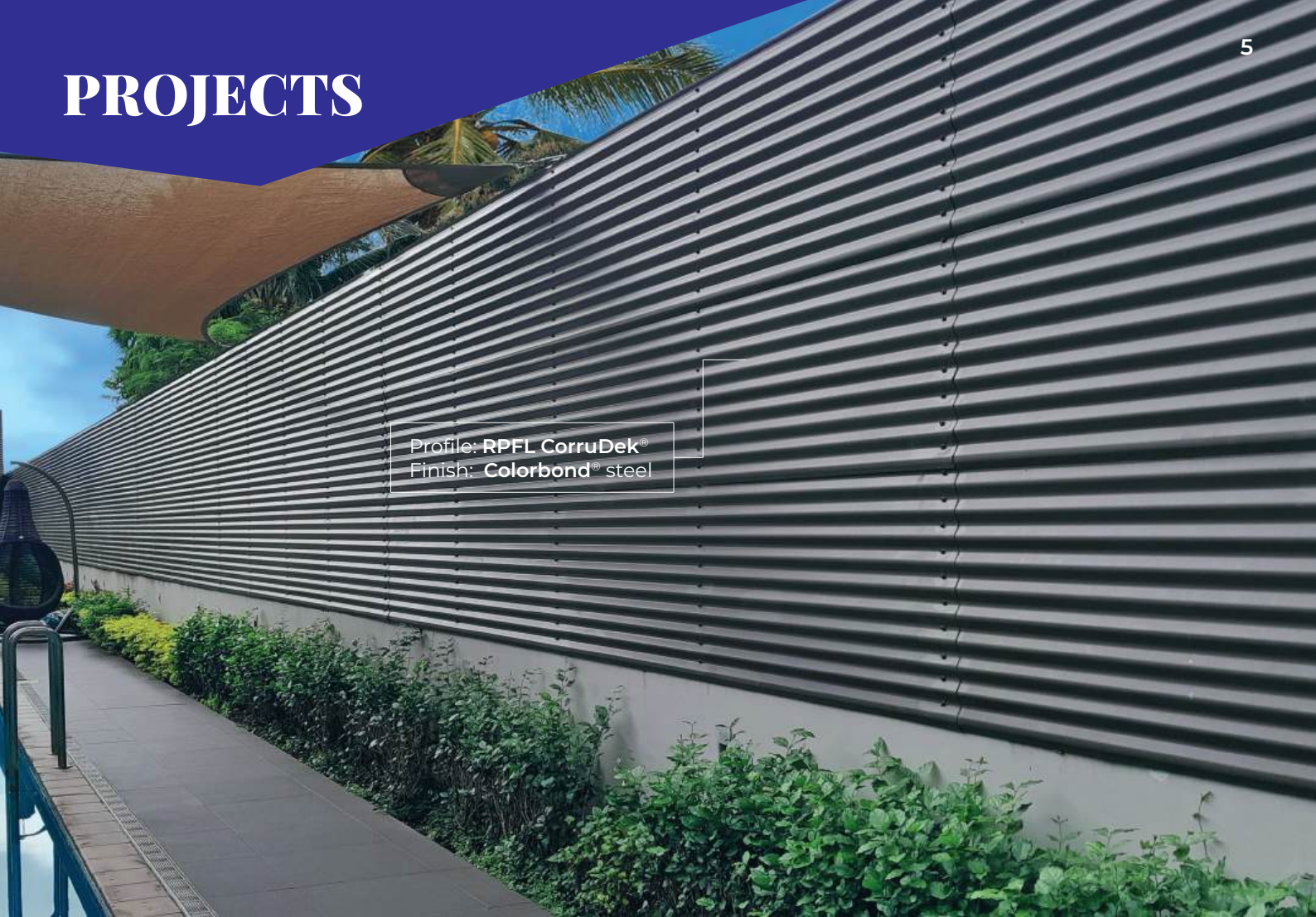
Profile: RPFL CorruDek® Finish: Colorbond® steel