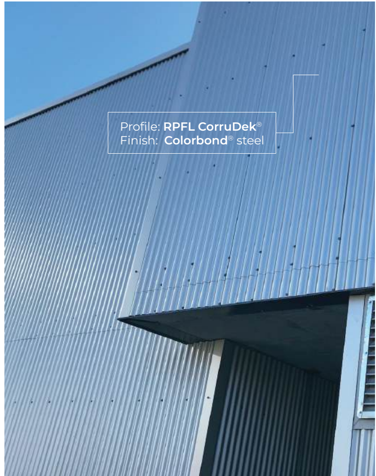
Profile: RPFL CorruDek® Finish: Colorbond® steel