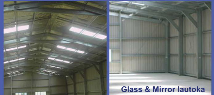
Glass & Mirror lautoka

All our designs comply with the Fiji National Building Code and are Cyclone Certified