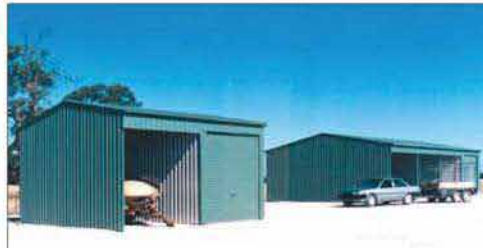
Open Farm Sheds with enclosed bays