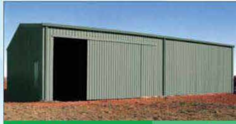
Farm Shed with sliding door