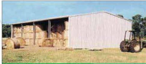
6m bay open Hay Shed