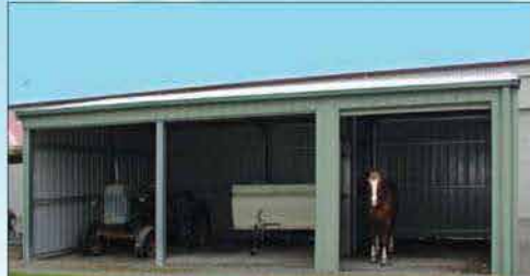
3 bay Farm Shed with roller door in one bay