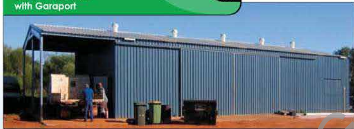
Large Farm Shed with closed in lean-to