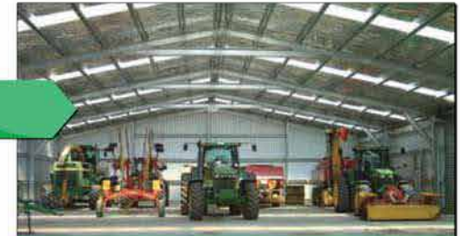
Internal view of Industrial building